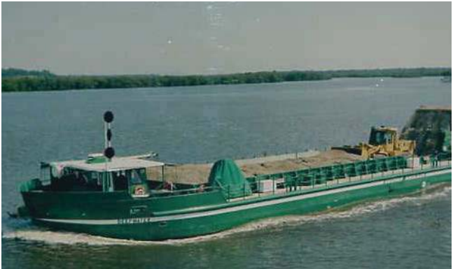
Figure 3 – SLV "MV Deepwater"

Part of the hull design also incorporated a 'V hull' shape which birthed the first "no ballast" bulk carrier the " MV Deepwater " in 1990.