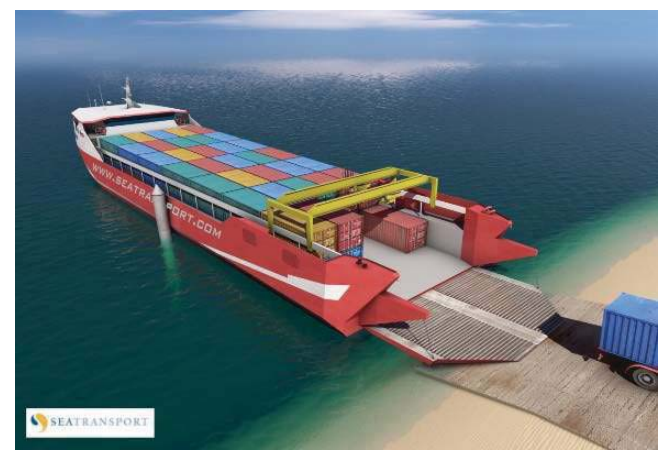
Figure 2 - SLV on the beach

Part of the hull design also incorporated a 'V hull' shape which birthed the first "no ballast" bulk carrier the " MV Deepwater " in 1990.