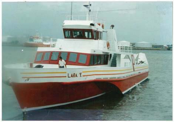
Figure 7 - LARA V, after alteration.

Without touching the vessel's engineering or electrical system, gull wings either side of the vessel were fabricated and attached. With buoyancy of the added shape equal to the weight added including a 5 metre SLV stern section, the vessel ended up carrying the required 65 tonnes as well as gaining another knot in speed.