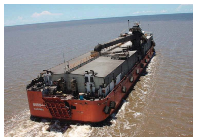
Figure 5 - MV Wunma, with a well deck configuration