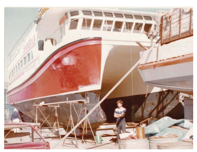
Figure 1 - Shangri La 20m Catamaran, hull centrelines toe out, asymmetric hulls with bulbs. Strathclyde Ph D. Student Apostolis Tsanticos standing in photo.

Catamarans in those days had a poor reputation for sea handling, so it was in the tank test facilities in Strathclyde where a series of tests with symmetric and partial asymmetric catamaran hulls with bulbous bows was carried out.