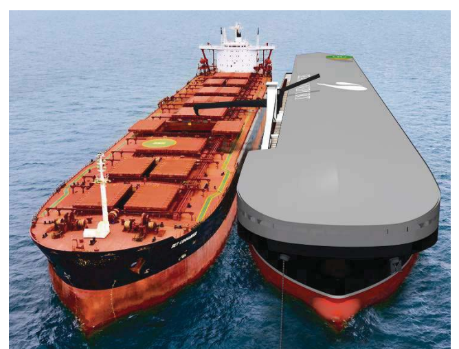
Figure 8 - Floating Harbour Transhipper (FHT)